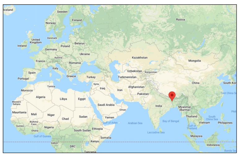
Pupils at Sutton will be connecting with children 4,824 miles away!